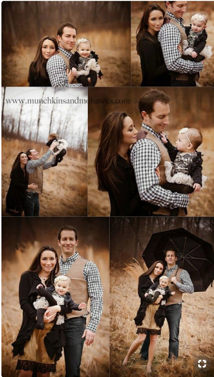
Dads shirt pattern is too bold

All of the samples below are from Pinterest telling you what to do. All of these have at least one person's clothing in them that distracts from the family group.