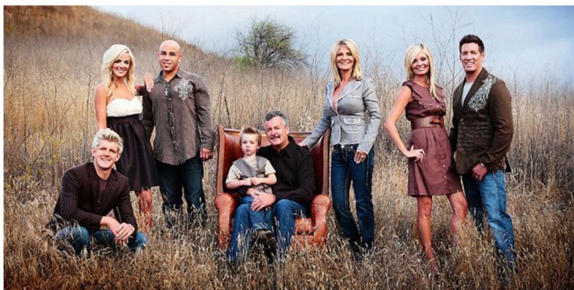
Very good color harmony.