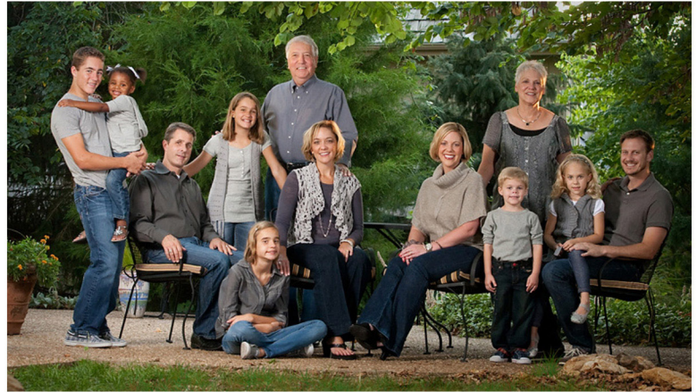
Both Groups created color harmony but no bold patterns, see how you see the faces!