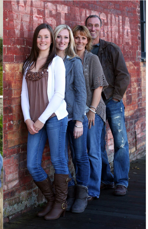
White sweater is all you can see.

Black and white sweater is dominant plus bold red can be a bit much.