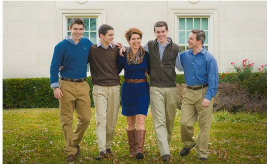
Royal blue dress draws all the attention