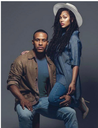
Simple clothing sometimes makes the strongest statements. See how the faces stand out.